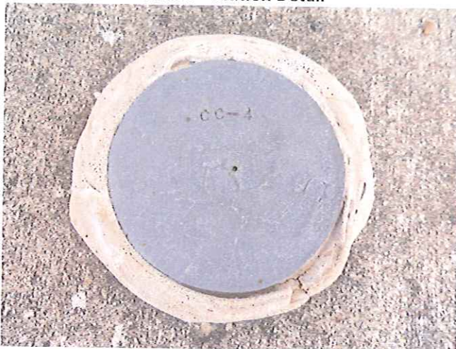
Photo – Station Area